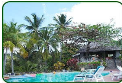
Private villa in St. Lucia

Remember, fundraisers like this enable us to offer scholarships to the grieving children who use our therapy and support services. We work to ensure that no child grieves alone.