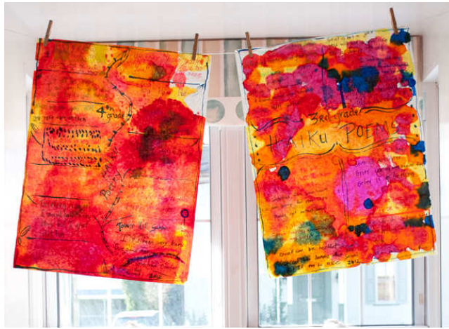
Grief Haikus by the 3rd and 4th grade classes at Tower Hill School from our 2012 Expressions of Grief exhibit.

Thank you to our sponsors: Total Family Solutions, M&T Bank, New Castle County Council, and WSFS Bank.