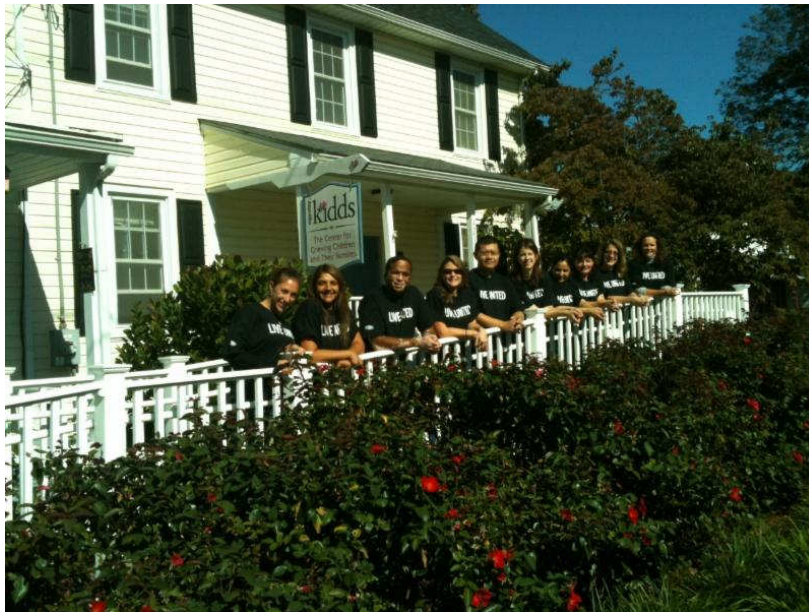
A large team from DuPont helped us recently. They gardened, cleaned, organized supplies, and called local schools to spread the word about our upcoming Expression of Grief art exhibit.

You can donate on our website or by mail.